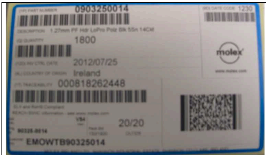
Figure 6 – Molex Outer Carton Label Example