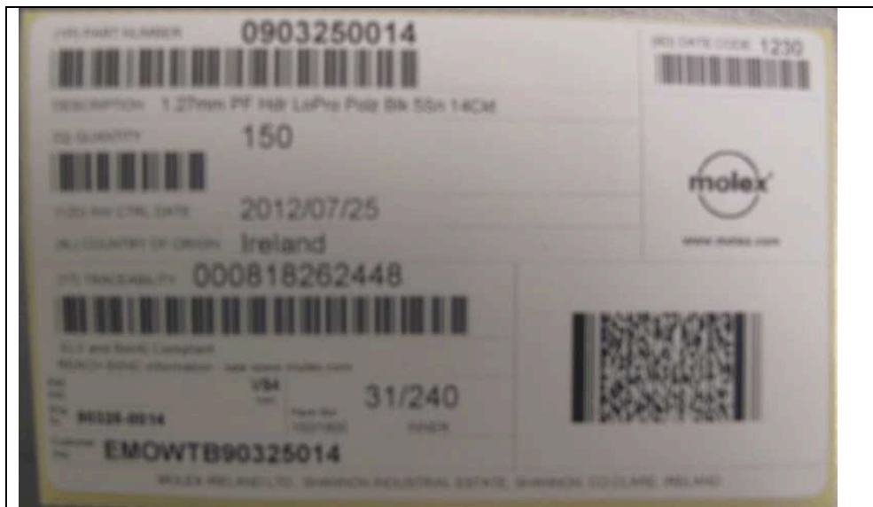
Figure 5 – Molex Bag/Reel Label Example

Figure 7 below is an optional label which when required is automatically printed with the order and placed on the outside of the bag/carton.